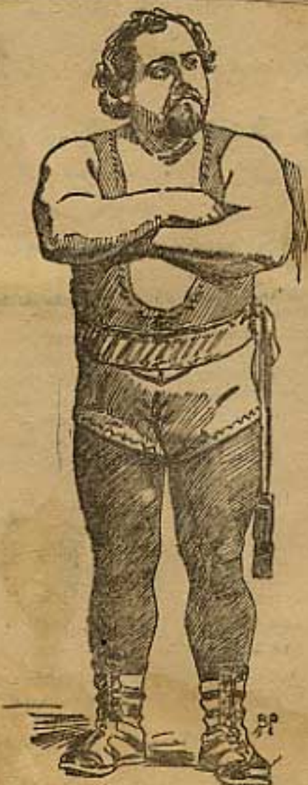
Cyr, Strong Man, At Huber's Museum.

THE SUNDAY ADVERTISER, NEW YORK, NOVEMBER 8, 1896.