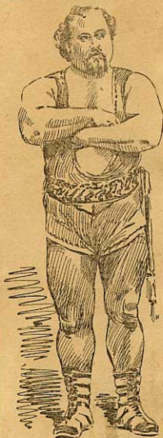
LOUIS CYR, Police Gazette Champion Heavy Lifter of the World.