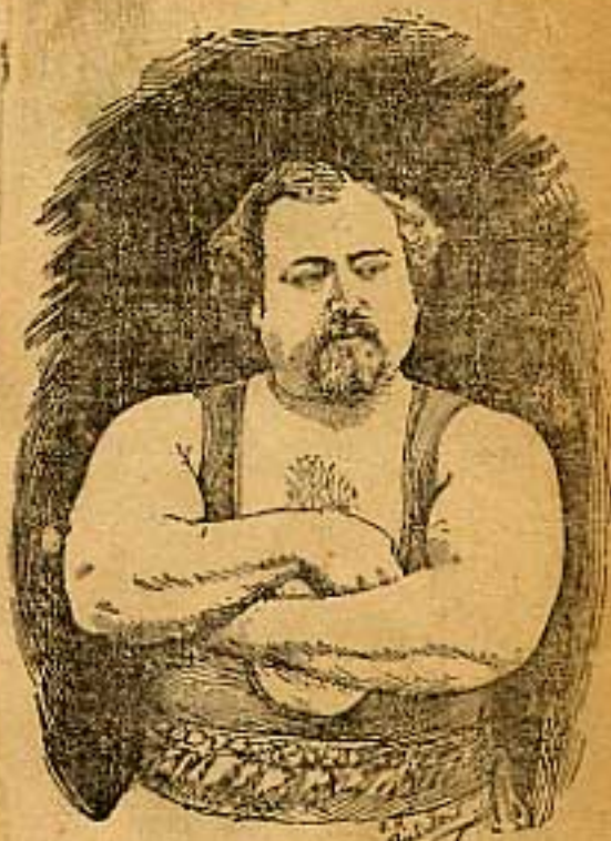
LOUIS CYR, One of the world's strongest men—now at Huber's Museum.

40 New acts. Theatre-Big Vandeville All Star Co., Kinematographs new pictures. Special Sacred Sunday Concerts. Double Co.